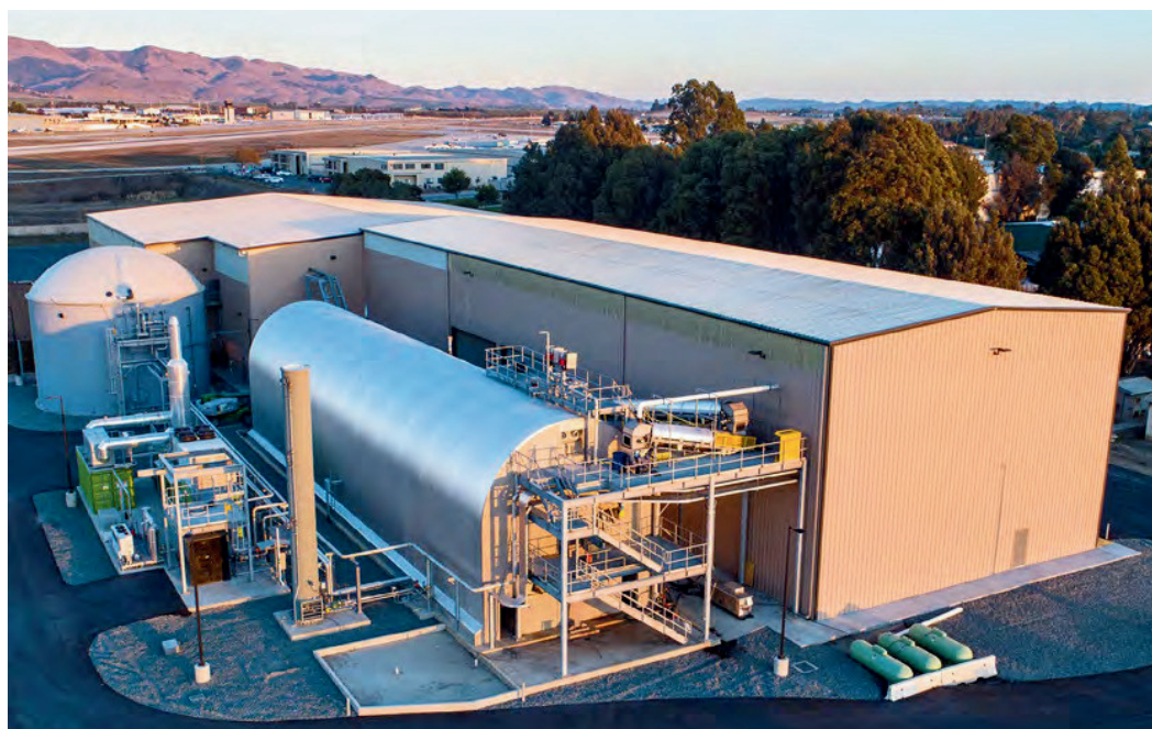
The Kompogas dry AD plant in San Luis Obispo is one of the most advanced installations of its kind in the US

At the end of 2018, the company made the leap to North America with the construction of a Kompogas