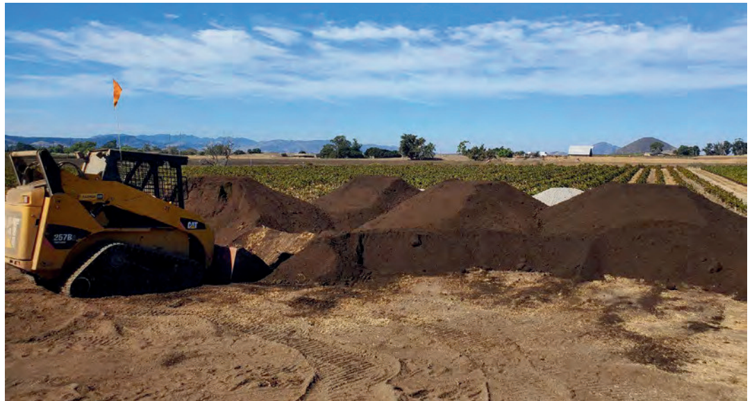
Wolff Vineyards processes around 200 metric tons of compost in their post-harvest soil enriching procedures.

The SLO Kompogas plant and the Booker Noe Distillery are lighthouse projects for a US-wide approach to fossil-free energy. More and more media and environmental organisations are presenting awards to companies making