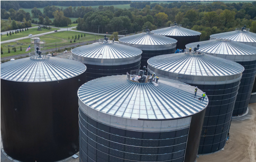
The Booker Noe distillery expansion will supply 65% of the distillery’s energy requirements through anaerobic digestion of stillage

the regular organic waste tends to be drier and less abundant in autumn, the residues from pressing the grapes and producing the wine contribute a great deal to the stable operation of the plant.