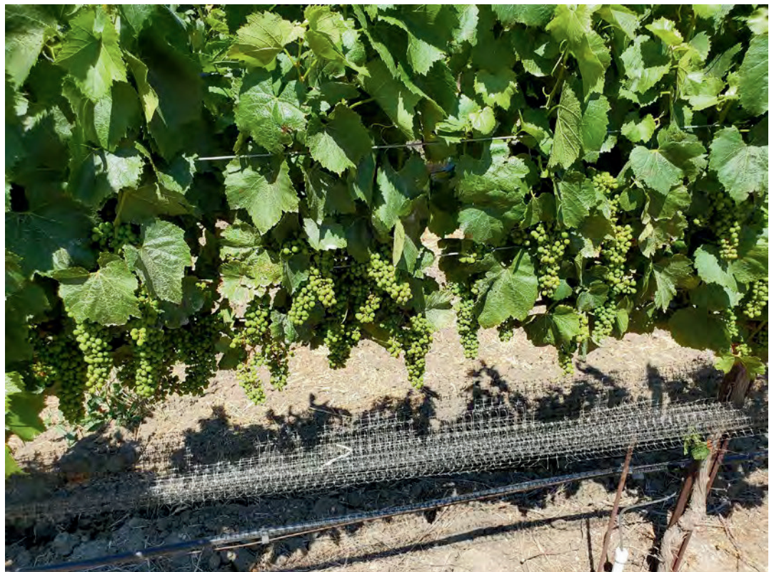
The feedstock is high in sugar and supports the stable production of biogas during the dry season. Vineyards deliver their pressing residues

It is not only wineries that benefit from Kanadevia Inova’s advanced biogas technologies. Booker Noe, and ultimately Beam Suntory, is currently expanding its production facility in Boston, Kentucky. On behalf of 3 Rivers Energy, Kanadevia Inova is building a wet AD plant with an integrated gas upgrading